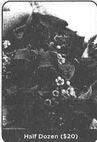
Half Dozen ($20)