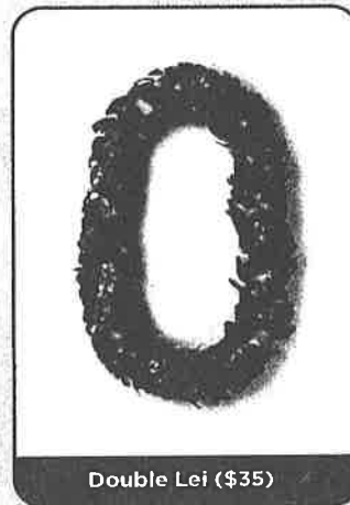
Double Lei ($35)