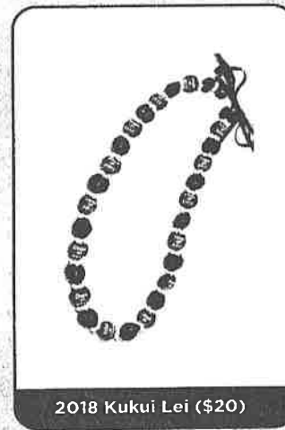
2018 Kukui Lei ($20)