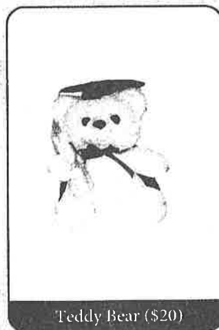
Teddy Bear ($20)